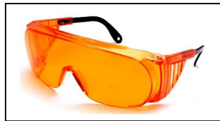
Safety Glasses 98452