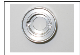
Dosimeter Adapter 1421420