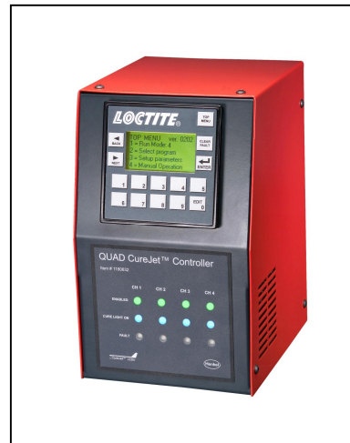
Quad Controller 1180632